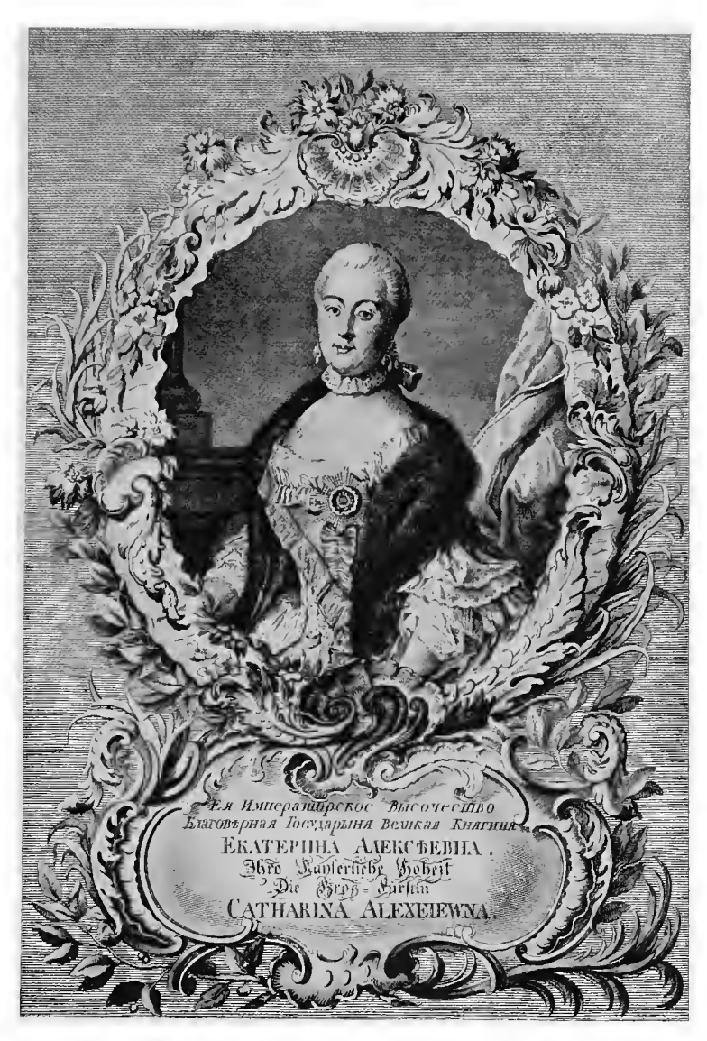
THE GRAND-DUCHESS CATHERINE, AFTERWARDS CATHERINE II #ETAT 29