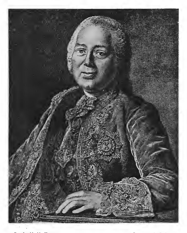
Графъ Н. И. Панинъ.