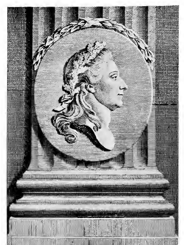
STANISLAVS PONIATOWSKI, KOENIG yon POHLEN.