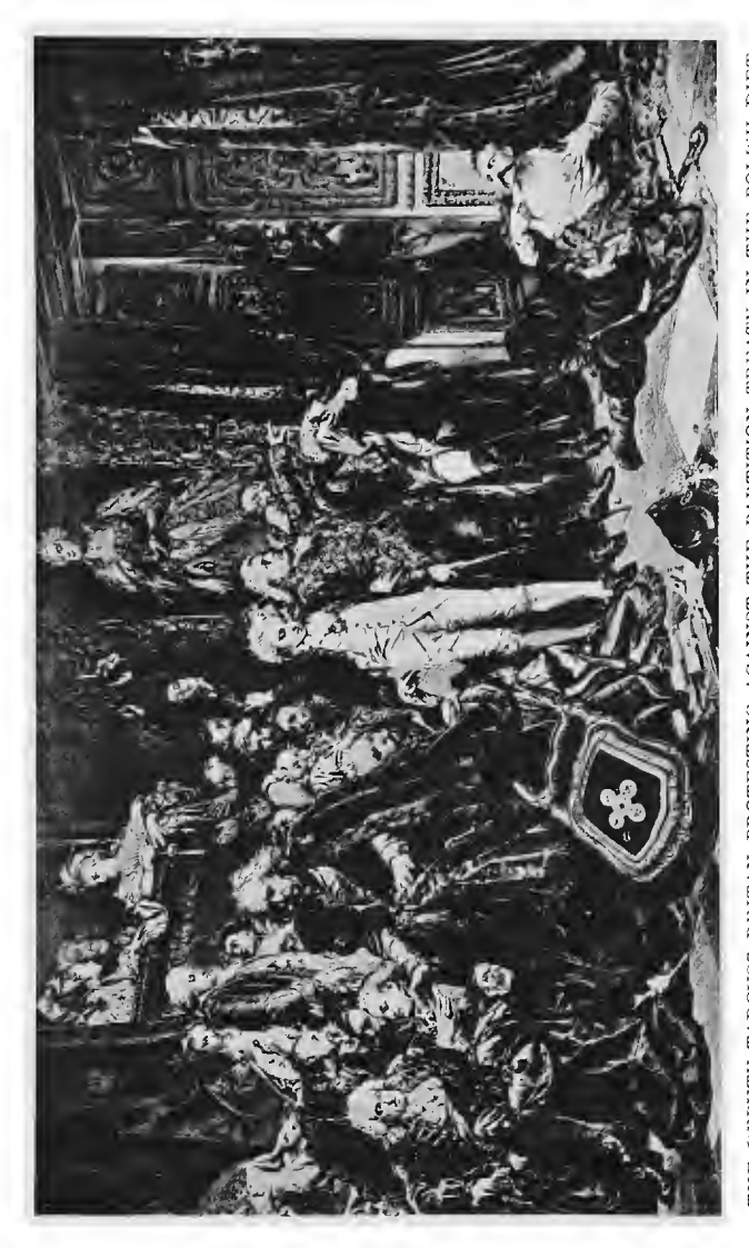
THE DEPUTY TADCUSZ REJTAN PROTESTING AGAINST THE PARTITION TREATY IN THE POLISH DIET FROM THE PICTURE BY MATEJKO