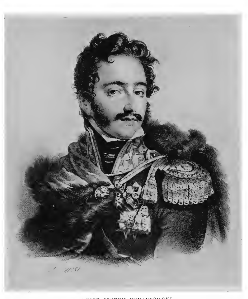
PRINCE JOSEPH PONIATOWSKI