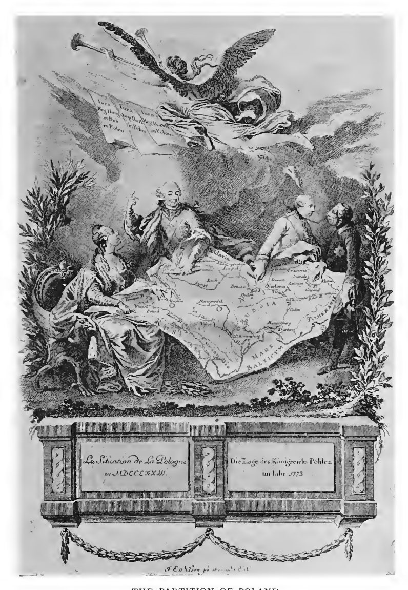
THE PARTITION OF POLAND

ON THE RIGHT FREDERICK II AND JOSEPH II, ON THE LEFT STANISLAUS II AND CATHERINE II