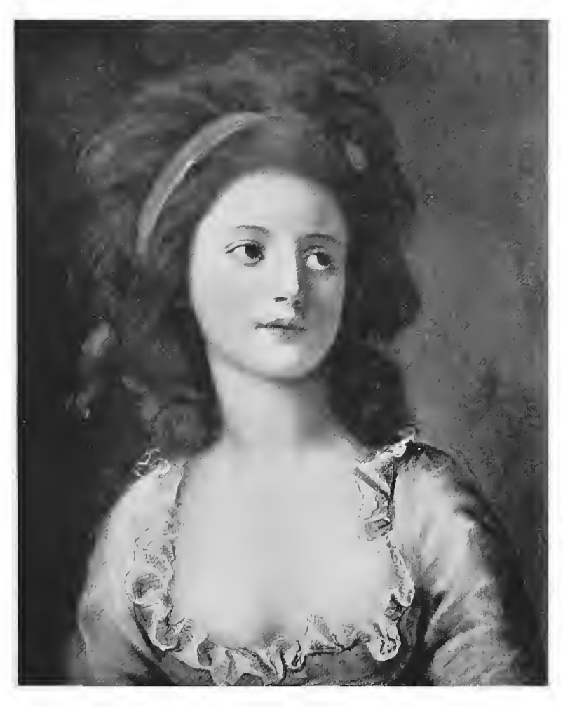
SOPHIA THE GREEK, THIRD CONSORT OF COUNT FELIX POTOCKI